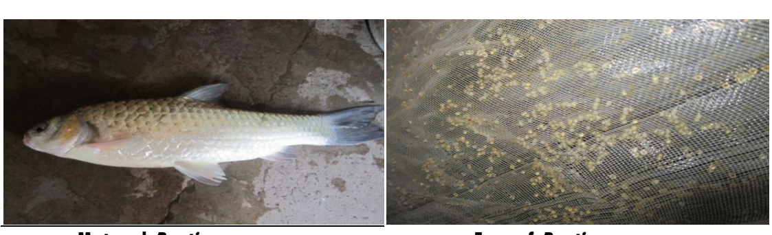
Matured Puntius sarana